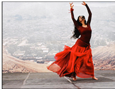
Dunia, showing in London only