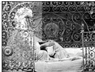
The Nouba, showing Friday 22nd Feb

Here we rundown the films that you can view in Cambridge and tell you when they're on. If you'd like to see the films showing in London, check out the extra events in the capital or just find out more about the Cambridge films, then go to the official website.